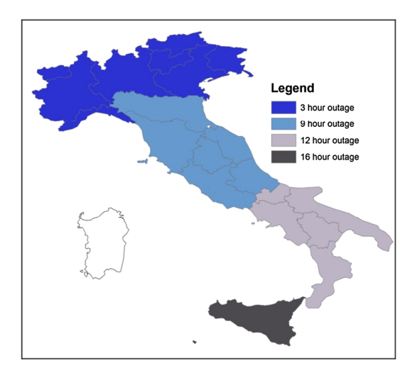
Fig. 1 Extent and affected periods of power outage in Italy on September 28th, 2003 lasting between 3 and 16 h